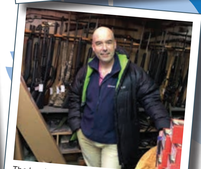
The local store stocked all the essentials