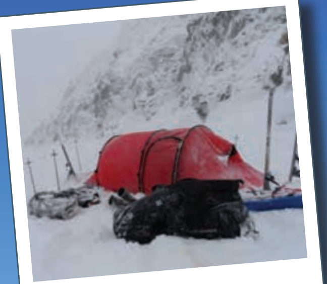
Home sweet home

"There is a lot still to do! I had a meeting at the Special Forces Club in on Skype. We are considering changing the dynamics of the whole trip to do something utterly